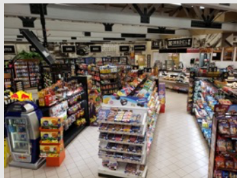
“Hinsdeli” Hinsdale IL